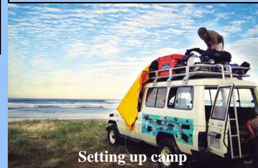
Setting up camp